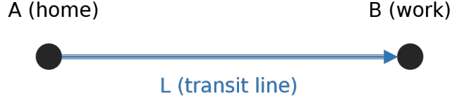
Figure 1: The setting of the problem

t_b and the latest time t_e . Note that, we discretize the departure time horizon into multiple time intervals, therefore, the travelers indeed choose a time interval.